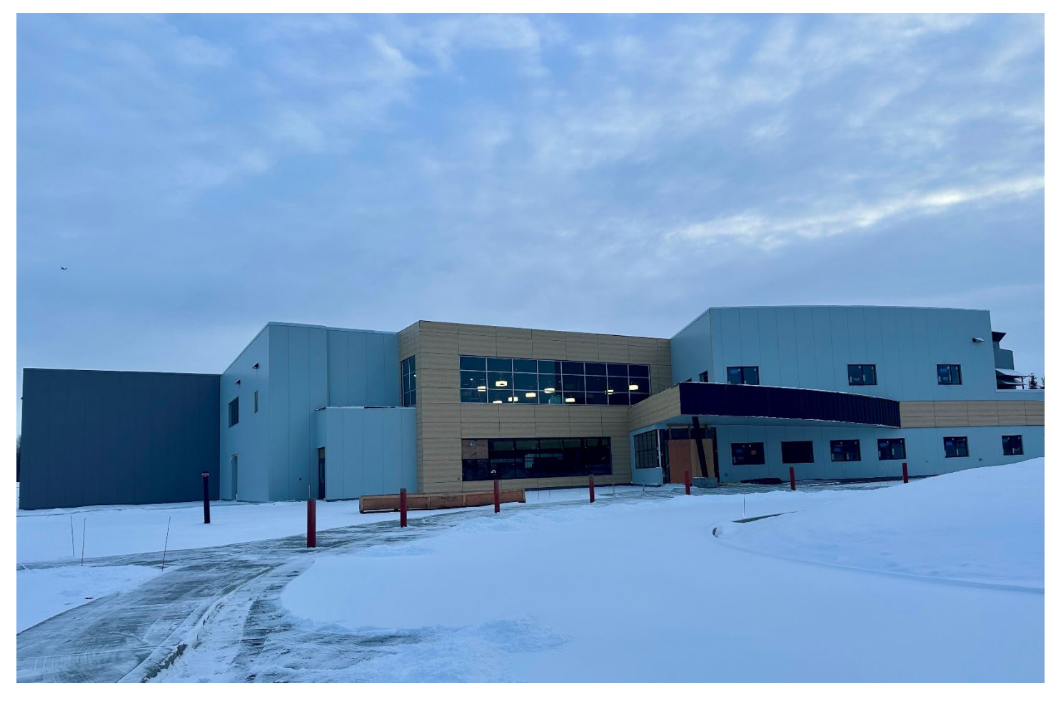
Future Mat-Su Central School – Scheduled to open in spring of 2025